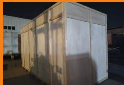
WOODEN BOX PACKING